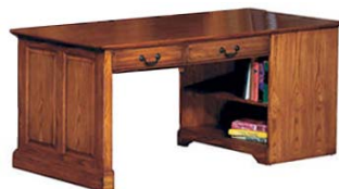
Partners Table 72"L x 32"W x 30"H