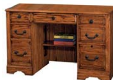
48" Computer Desk 48"W x 23"D x 30"H