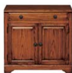
Storage Cabinet 32"W x 23"D x 30"H