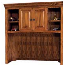
Hutch w/Doors 48"W x 16"D x 49"H