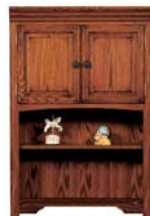
Hutch w/Doors 32"W x 16"D x 49"H