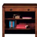
Kneehole Base 32"W x 23"D x 30"H