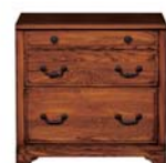
Lateral File 32"W x 23"D x 30"H