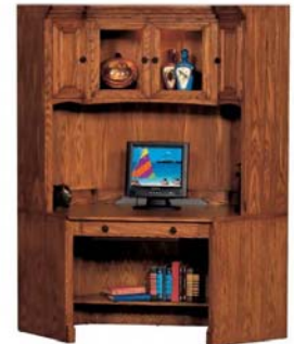
Corner Hutch 46 \frac{3}{4} "W x 16"D x 49"H