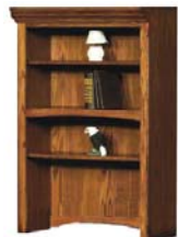
Open Hutch 32"W x 16"D x 49"H

Beautifully crafted with solid wood moldings and real wood veneers with a 10 step lacquer finish. English dovetail drawer construction. All drawers feature ball-bearing drawer slides. The Computer Base includes a keyboard/mouse tray, a printer pull-out shelf and a power director. The Writing Desk can be used from both sides, and the rolling file can roll underneath. The file drawers accommodate letter or legal files.