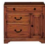
Computer Base 32"W x 23"D x 30"H